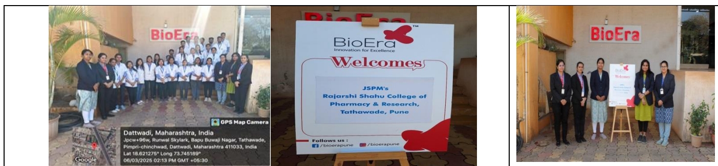
BioEra LifeSciences Pvt. Ltd., Pune, Team and JSPM's RSCOPR participants