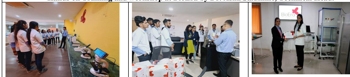
Industrial Tour at Product Showroom and Design Lab